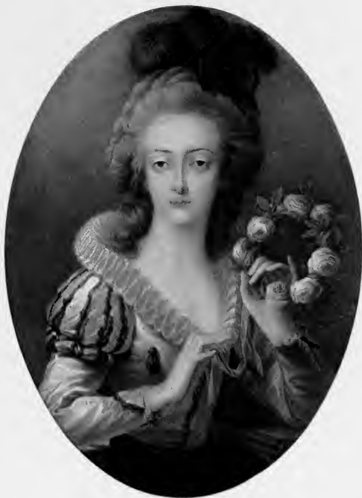
MARIE THERESIA, COUNTESS VON DIETRICHSTEIN BY HEINRICH FRIEDRICH FÜGER

LIBRARY OF THE MUSEUM OF FINE ARTS OF THE CITY OF BOSTON